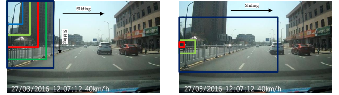
(a) original ACF detector

Eq. 4 is the foundation of multi-scale detection with distance prior. It indicates that if v_0, f_y and \alpha are estimated, the verti-